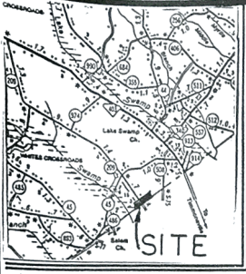
LOCATION MAP SCALE 1" = 2 MILES